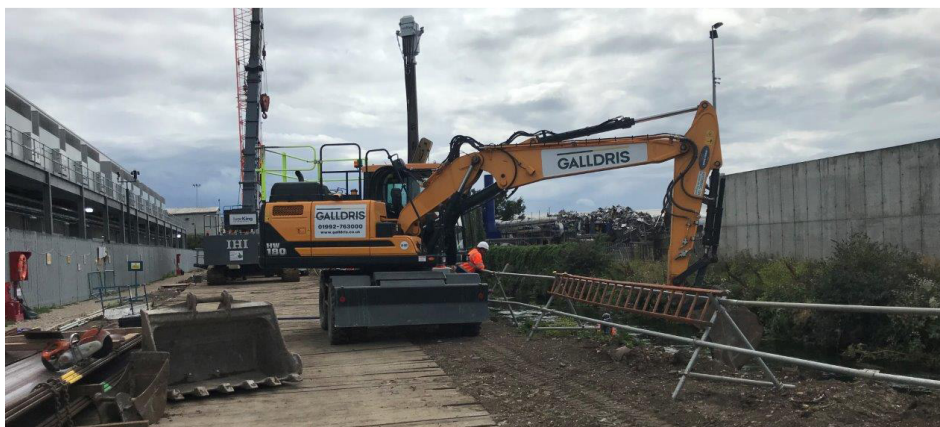
Piling works taking place at the Northern Access Road

Sites have been adapted to abide by social distancing rules and to keep the workforce safe. You can find out more about our safe working practices in our remobilisation video update on our website.