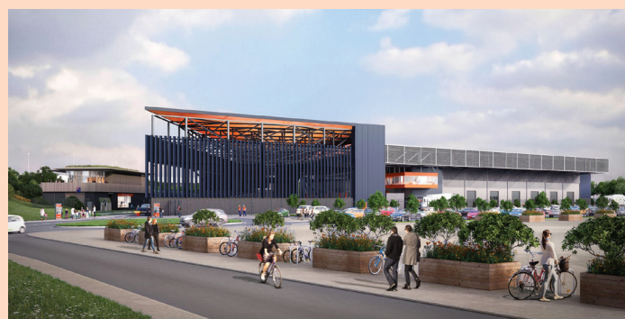
Indicative image of the Resource Recovery Facility, looking south towards the North Circular.

In February, we met with our Community Liaison Group, in April, we launched a fly-through