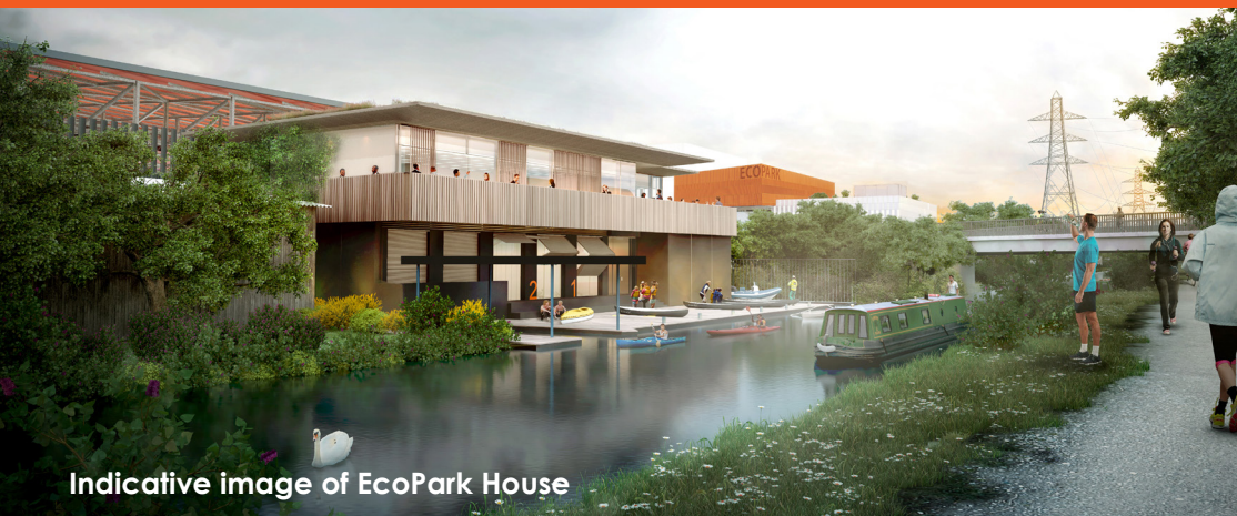
Indicative image of EcoPark House

Building this scheme for the community, we will adhere to the considerate constructors scheme and deliver this project safely, on time and cost-effectively.