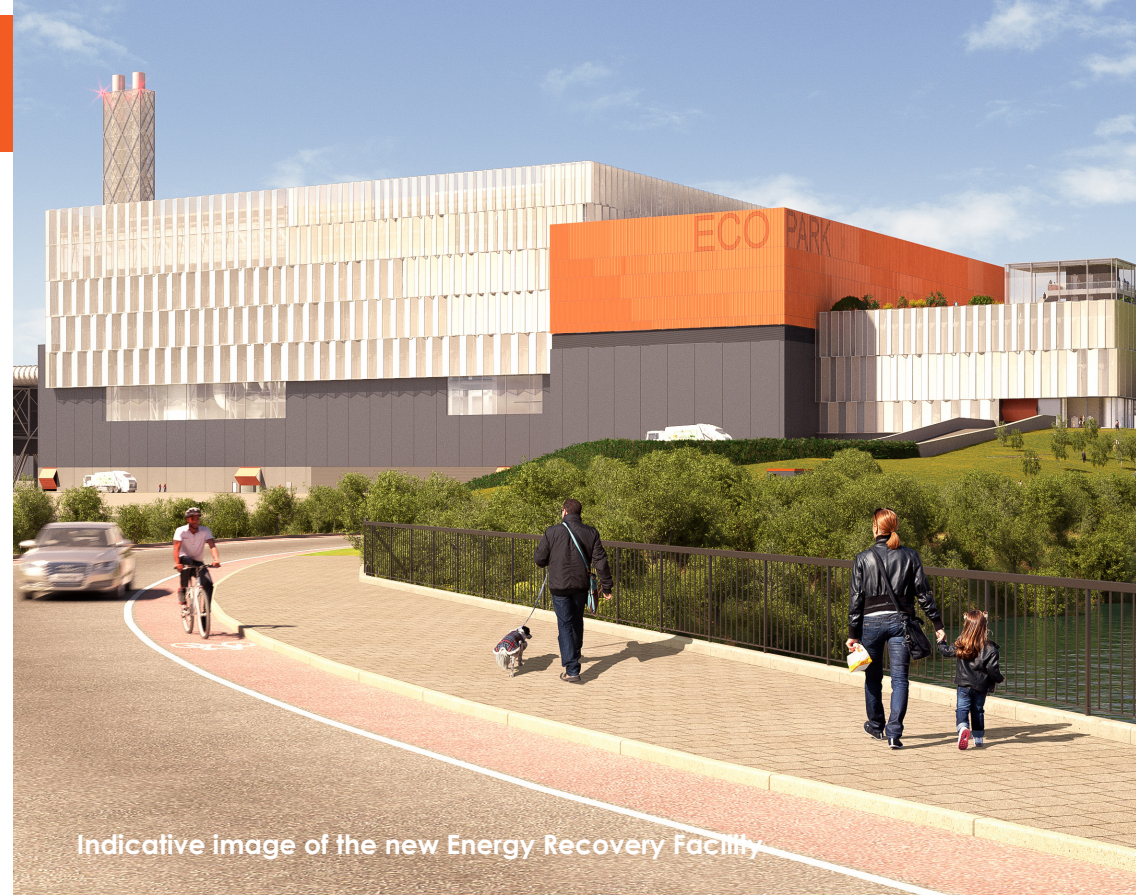
Indicative image of the new Energy Recovery Facility

This will be one of the most efficient and advanced facilities of its kind in the UK.