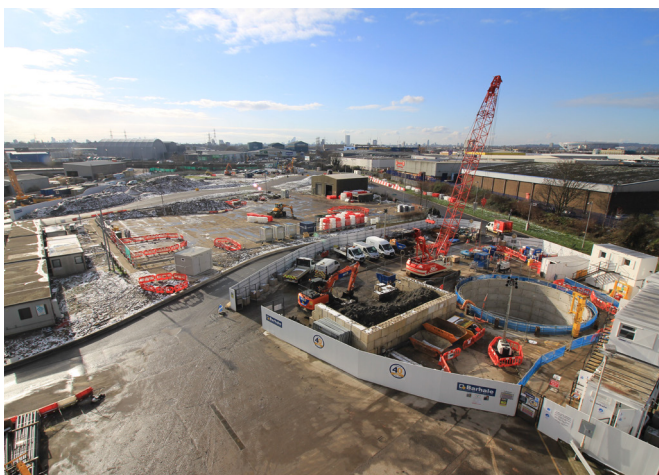
EcoPark South and Sewer Diversion construction sites

In January, major construction started to build brand new recycling facilities. Our contractor Taylor Woodrow will construct the RRF, Reuse and Recycling Centre and EcoPark House. So far, demolition and groundworks are underway, ahead of piling works starting in March. An innovative piling technique is being used to build the foundations of the future recycling facilities. Through using this technique, it significantly contributes towards reducing the embodied carbon on the original scheme by between 10-16%.