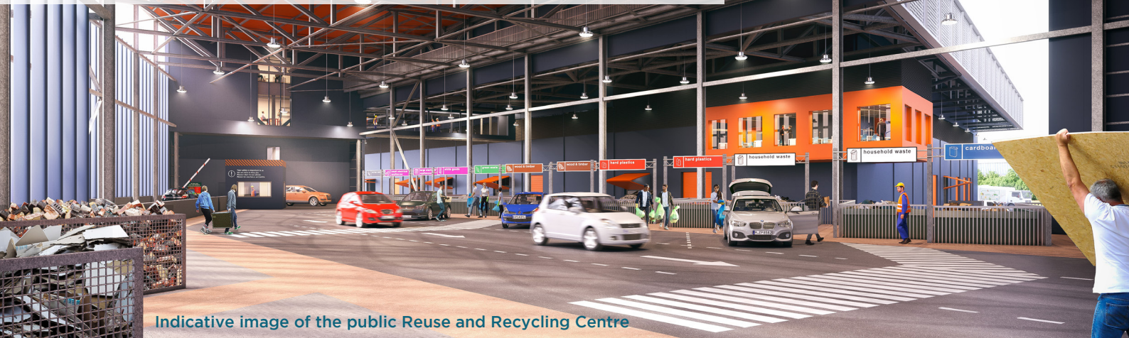
Indicative image of the public Reuse and Recycling Centre

W elcome to the February 2021 community newsletter for the North London Heat and Power Project (NLHPP). Here you will find all the latest news about north London's new sustainable waste hub which we, the North London Waste Authority (NLWA), are building at the Edmonton EcoPark.